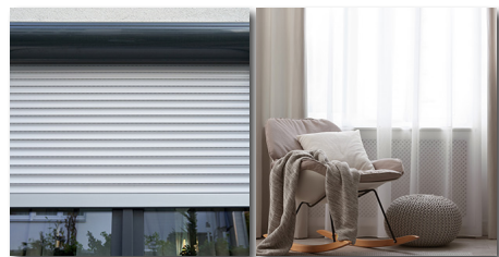
Roller shutter automation

Shelly Pro 2PM supports two-directional motor control, which makes it perfect for automation of roller shutters, curtains, awnings, and gates. Customers can use scripting functionalities to set custom automation scenes based on various occurrences, weather forecast, wind forecast, etc.